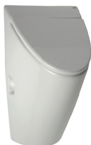
SLP 32 - ARQ WITH A COVER